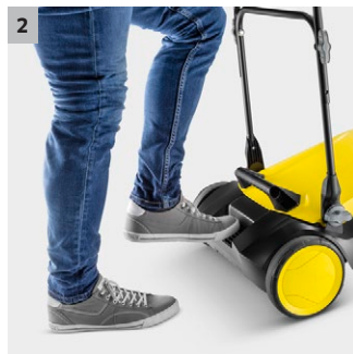
2 Comfortable footplate