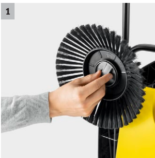
1 Practical cap for side brush

Two side brushes, 20 l waste hopper and 680 mm sweeping width: the S 4 Twin sweeper for year-round applications on smaller and narrower areas and thorough cleanliness right to the edge.